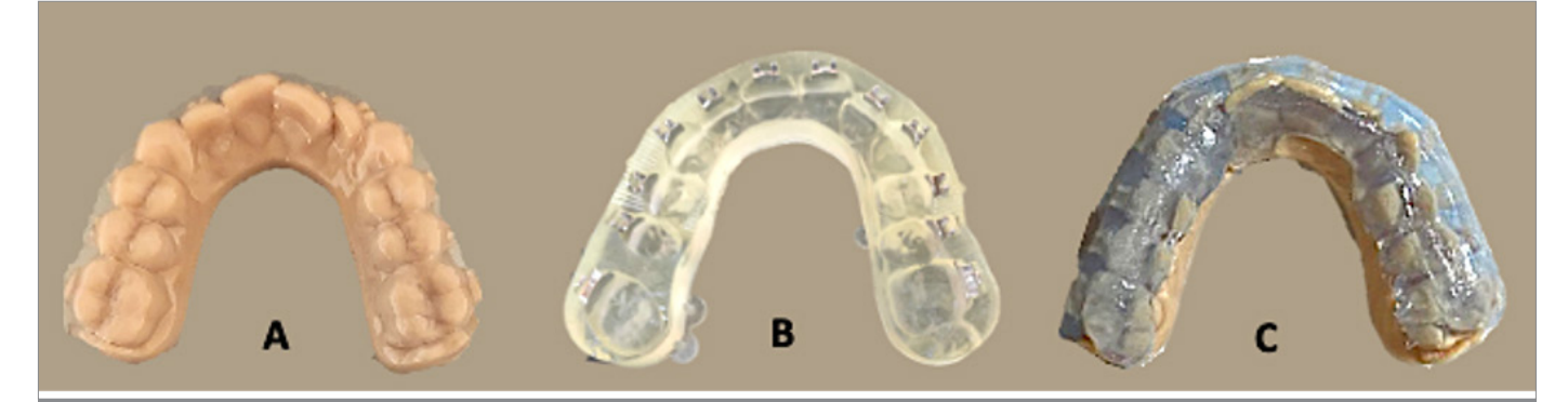
Figure 2. Three different indirect bonding trays A) Double vacuum formed tray (Group 1), B) 3D-printed tray (Group 2), C) Transparent silicone tray (Group 3)