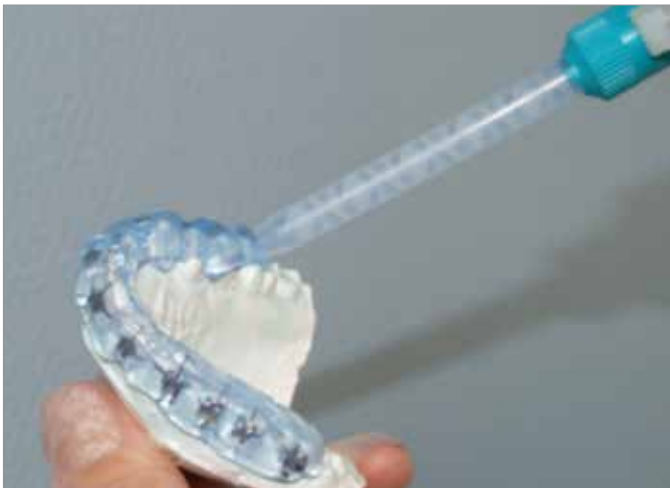
Figure 3. Fabrication of transparent transfer tray

recommendation of the manufacturer. If a thermally-cured resin is used, the model must be put in an oven of 120-170°C temperature for 15 min for the polymerization (2). For the light-cured resin, a light-emitting diode (LED) curing light must be used from mesial and distal surfaces for an additional 10 s for each tooth as the stone model does not reflect light like enamel.