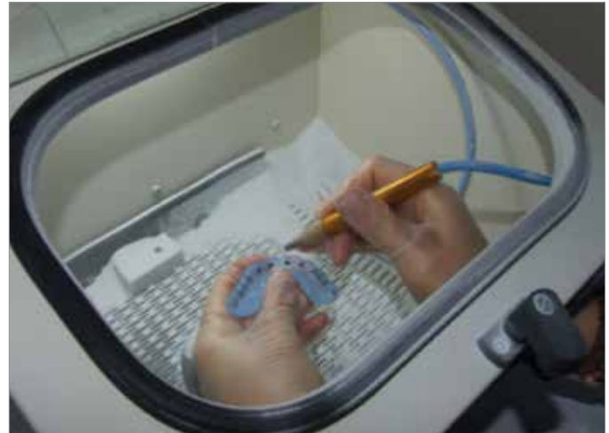
Figure 4. Sand blasting of composite custom bases