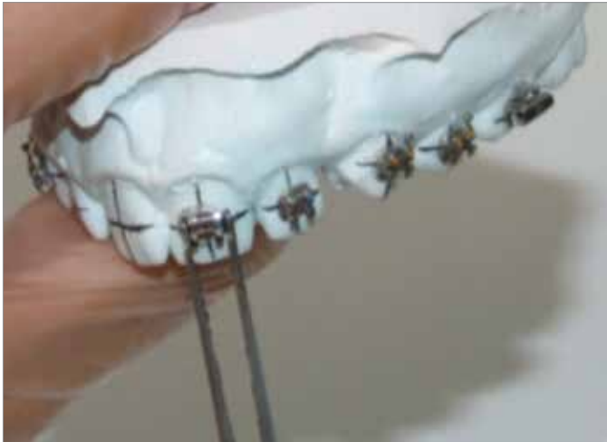
Figure 2. Bonding of brackets to the stone model